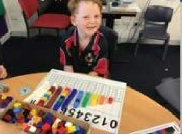
COLLABORATION, KINDNESS, POSITIVE MINDSET, SELF REGULATION, STAMINA