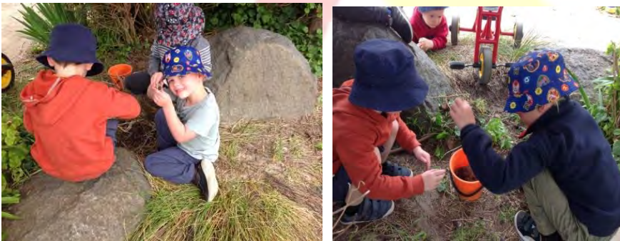
Searching for wildlife