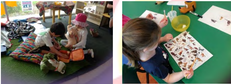
Where do animals live and making environments for them...