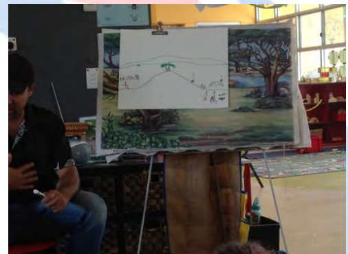
Making animal tracks in the sand