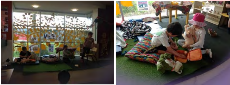
Opening our vet and looking at pets as animals, sorting and categorising.

We have been learning about the pets we have in our at home environment. We later compared pets to the wild animals we have in Australia and used the Child Safe Curriculum to teach about approaching other people's pets and what to do when we see Australian wildlife. We used graphing as ways to collect data on what pets we have, how many legs animals have and what people's favourite colours are at Preschool.